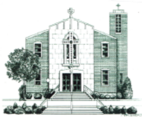
Saint Patrick Church Chatham, New Jersey